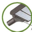
LF3-STR Street light arm (6" long to fit 2"-2-1/2" pipe)