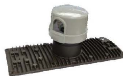
LF3-PK Photocell Kit for LF3 80W, 100W & 150W Field installed