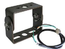
LF3-YOK Included in the box Not used when other mounting options ordered

Ordering example: LF3-220CW-YK + LF3-EXTARM