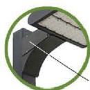
LF3-EXTARM Extension arm (4" wide to fit 4" pole)

Optional mounts - Field installed, must be ordered separately